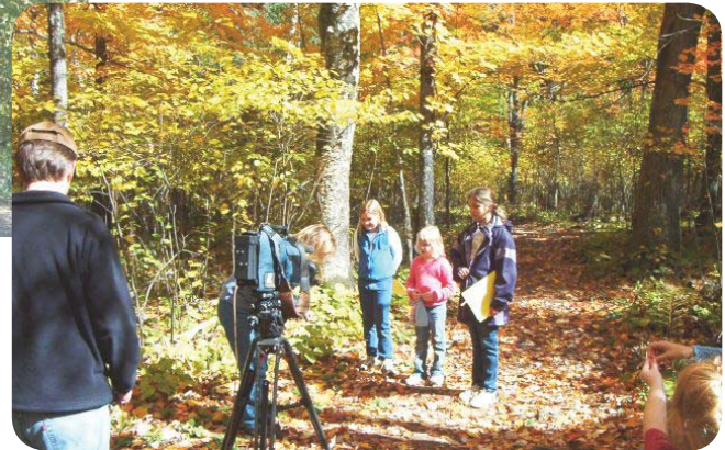
A fourth grade class works with first graders to identify leaves, mushrooms, tracks, and other natural things in the forest. Public Television staff from Venture North filmed a segment to air in the fall of 2006.