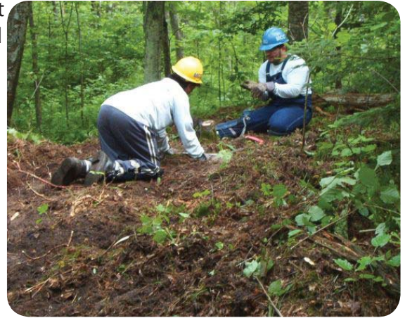
Minnesota Conservation Corps members help clear trails.

In order to make the Carlton School Forest more accessible, one mile of handicapped accessible trail and another 1/4 mile of more primitive trail were constructed. The trails are accessible to approximately 4,800 students from six school districts located within seven miles of the facility.