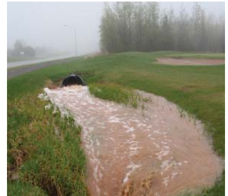
Stormwater runoff after a large rain event in Two Harbors, MN

The Lake Superior Association of Soil and Water Conservation Districts (LSA) has identified stormwater management as its focus area. Increases in stormwater regulations and the addition of North Shore streams to Minnesota's impaired waters list, have raised awareness of how stormwater runoff impacts water resources. The LSA is a natural leader for needed stormwater management conversations in the basin, as they work with a diverse audience: private landowners, local governments and boards, and developers. By assisting with regional stormwater management needs, the LSA can provide consistent permit, design, and site reviews, assist in planning, management, and enforcement, and build regional capacity.