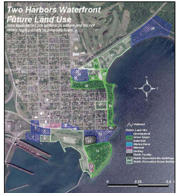
Future land use, from the Two Harbors Comprehensive Plan Amendment, May 2005