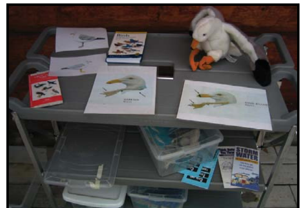
One of the ShoreLink carts, used to guide discussion about the relationship between humans, gulls, and the Lake.