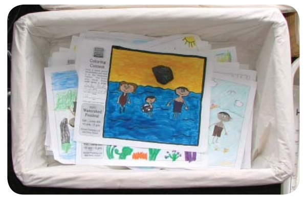
A coloring contest, distributed via local schools and the Duluth News Tribune, brought many familes to the Festival