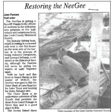
The restoration gained the interest of the Cook County News Herald