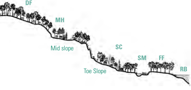
Which plant communities occur on your property?

See: MN-DNR. 2005. Field Guide to the Native Plant Communities of Minnesota: The Eastern Broadleaf Forest Province. MN-DNR. (both available at www.dnr.state.mn.us/ ecological_services/pubs.html)