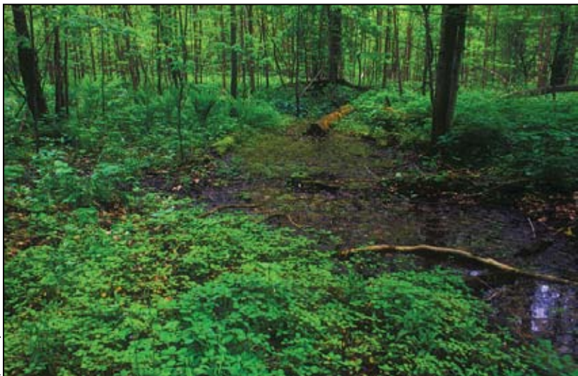
Wabasha County, MN