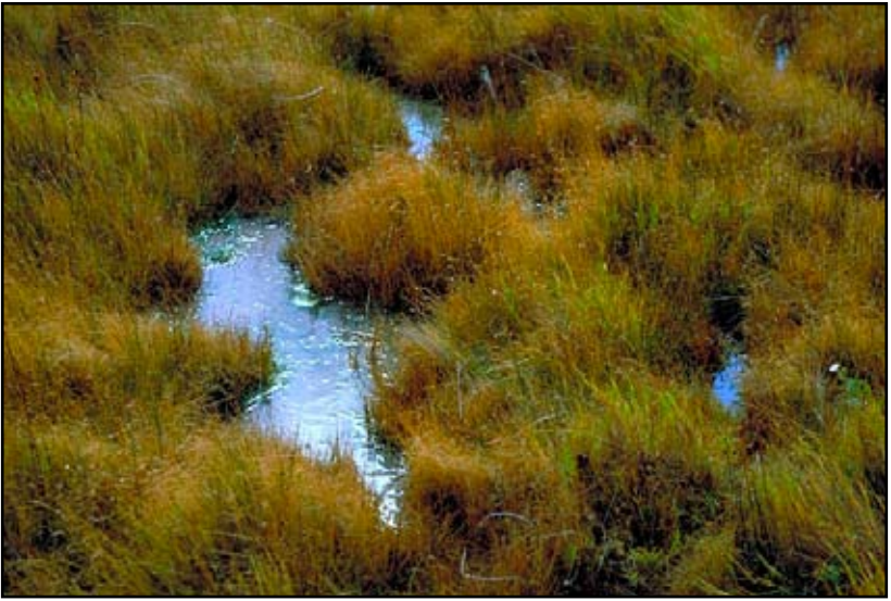
Yellow Medicine County, MN