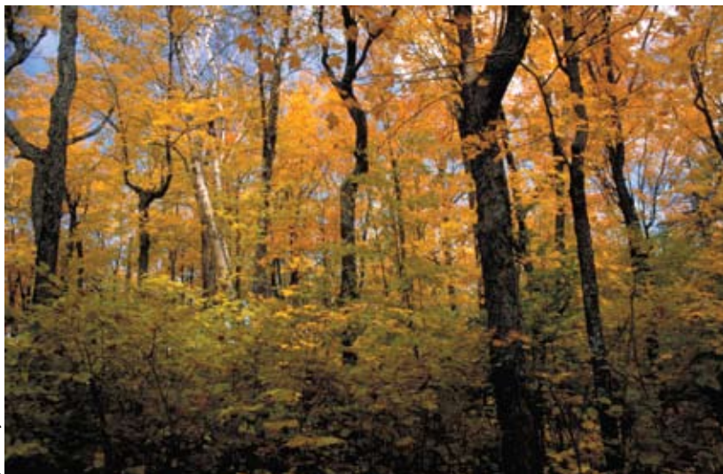
Tettegouche State Park, Lake County, MN