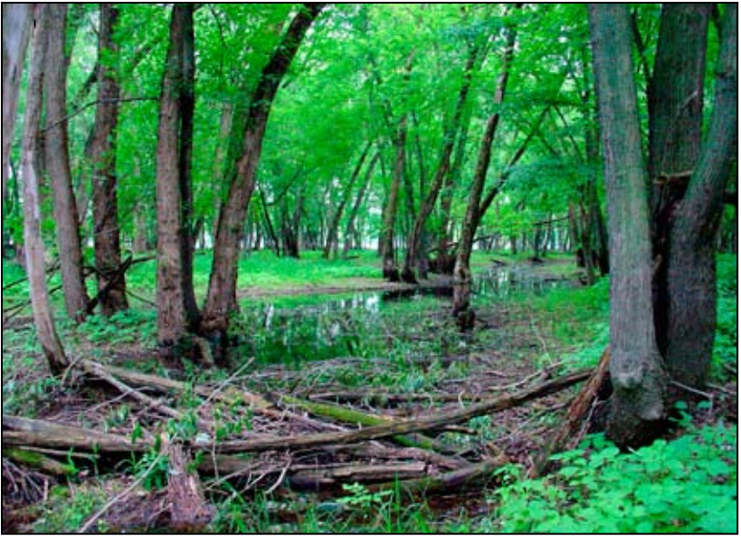
Sherburne County, MN