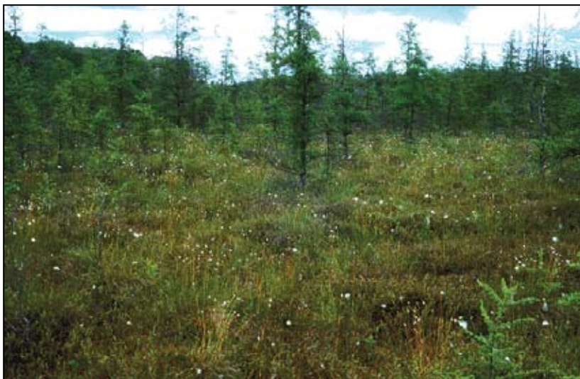
Todd County, MN