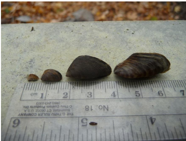
Figure 3. Picture of one of the smallest zebra mussels found on a rock at the property (Top) and a picture of the four different sizes of zebra mussels found (Bottom). Although four different sizes were found, very few were less than 1 cm.