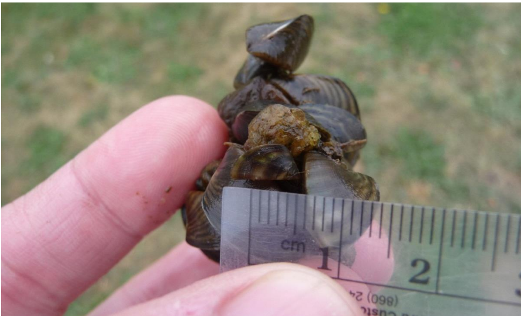
Figure 4. All of the rocks removed by the diver that had zebra mussels attached (Top). Picture of one of the smallest zebra mussels found on rocks by the diver (Bottom).