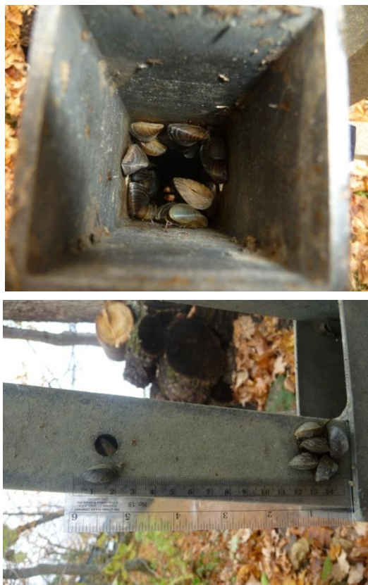
Figure 2. Zebra mussels inside the tubing and at other locations on a boat lift pulled from Lake Irene after being transported there from Lake Le Homme Dieu.