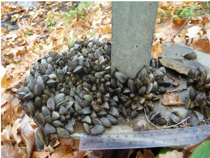
Figure 1. Picture of one of the feet of a boat lift pulled from Lake Irene after being transported there from Lake Le Homme Dieu.