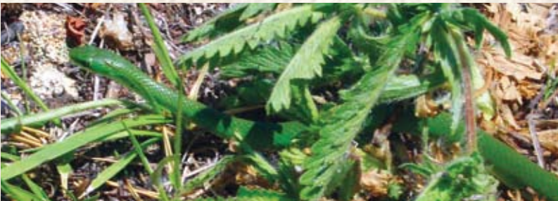
Color variation in two Smooth Greensnakes.