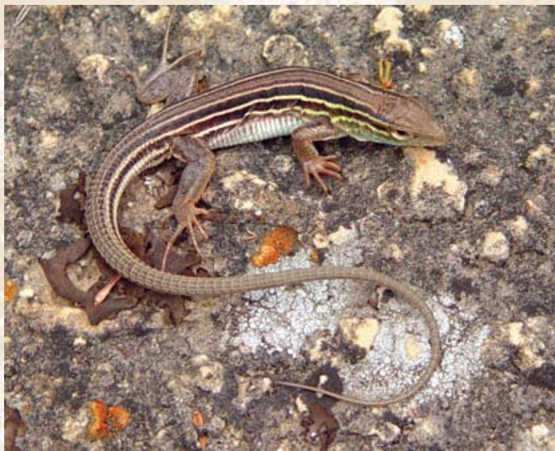
MNDNR-Kelly Lynch Pharis