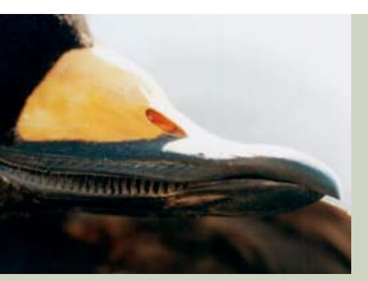
A close-up photograph of a black scoter's bill shows its pronounced ridges, called lamellae, which it uses to filter food from the water.

view, I ask my wife, brother, electrician, mail carrier, or anyone I can find for a quick critique. I ask them what they like or don't like about the painting, or what doesn't look realistic to them.