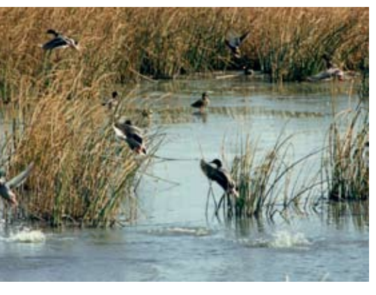
The South Carolina Waterfowl Association's mallard release program gave artist Joe Hautman a chance to see a live duck up close (top). Taking photographs (above) of wildlife can help an artist accurately draw and paint animals in action in their natural habitat.

To win a duck stamp contest, you need to create a realistic portrait of a particular duck species in its natural habitat. So I spend a lot of time outdoors observing ducks and other wildlife. I take a lot of photographs and also hunt ducks. These are all great ways to learn to identify the different species of ducks and to understand their behavior.