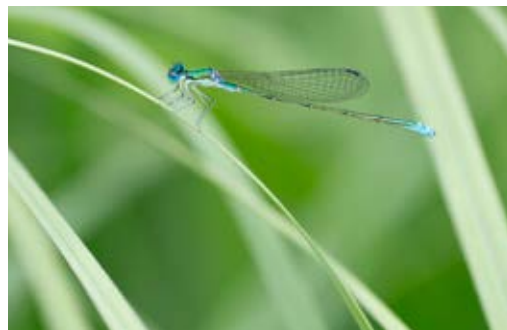
Above: Moving in closer simplifies the background so the damselfly shows up better. Right: Placing the boy and the snake on the left side of the photo follows the rule of thirds.