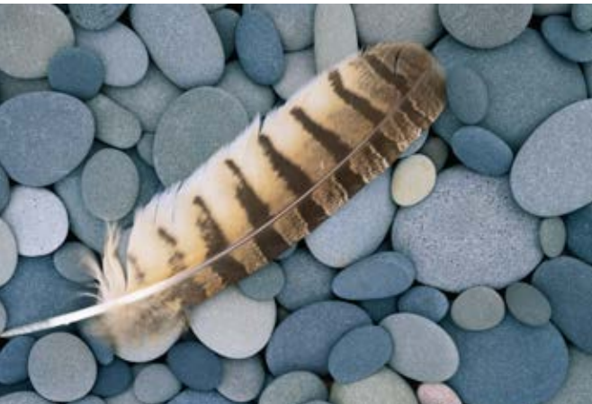
Left: On the shore of Lake Superior, an owl feather on surf-smoothed stones shows pattern and shapes. Right: The pattern of feathers stands out in this close-up shot of a peregrine falcon.

Try shooting while lying on your belly, for a worm's-eye view of things. You'll be surprised what you can discover when you change your point of view.