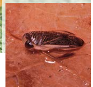
ALLEN BLAKE SHELDON

Like a rower with oars, the insect has long, oar-shaped back legs with fine hairs called setae . When the water boatman stretches its back legs to the front of its body, the setae flatten out. Then, for the power stroke, the water boatman pulls its legs back and the setae spread out to make a perpendicular blade. The friction between the water and the legs causes the insect's body to surge ahead. At the end of its power stroke, the water boatman moves its "oars" forward and begins again.