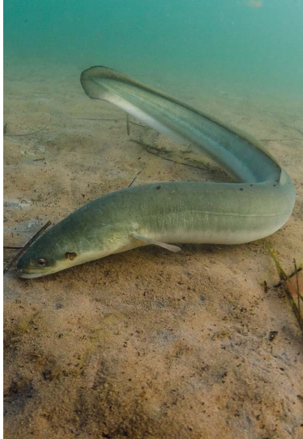
MAP BY MATT KANIA, AMERICAN EEL BY SEAN LANDSMAN/VENGBREITSON UNDERWATER PHOTOGRAPHY.