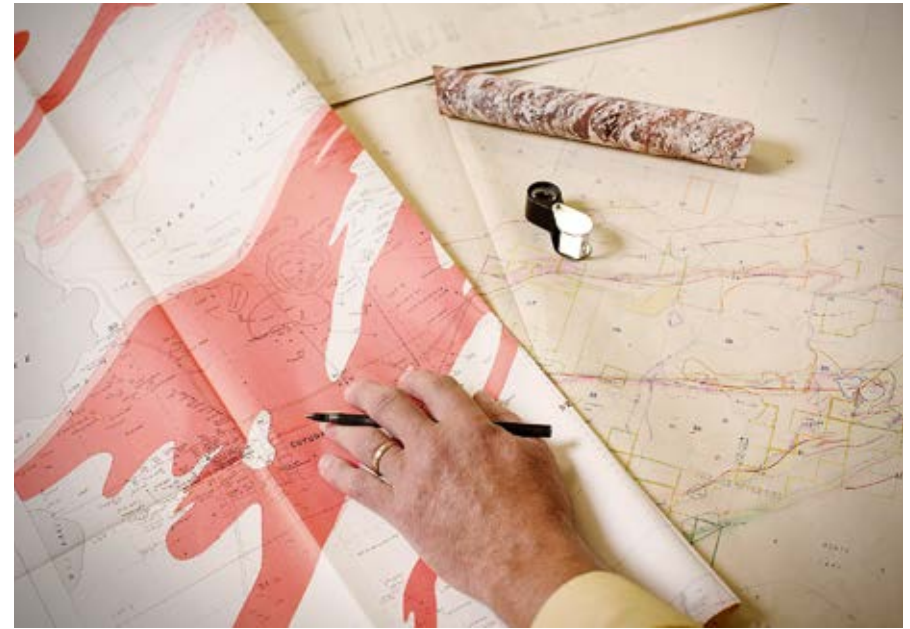
Besides computer-based maps, geologists today study historical maps. In the 1950s, geologists used these maps to help find the location of iron-bearing rocks on the Cuyuna Iron Range in central Minnesota.