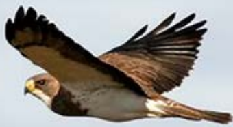
Swainson's hawks migrate to South America in flocks of thousands. These birds fly only during the day.