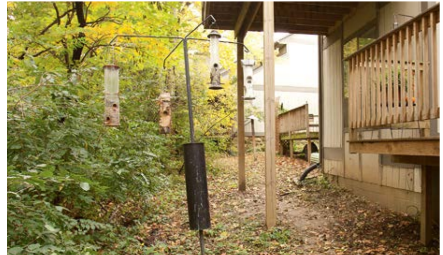
A bird-friendly spot has seeds to eat. Among trees and bushes, birds can hunt for insects and hide from predators.