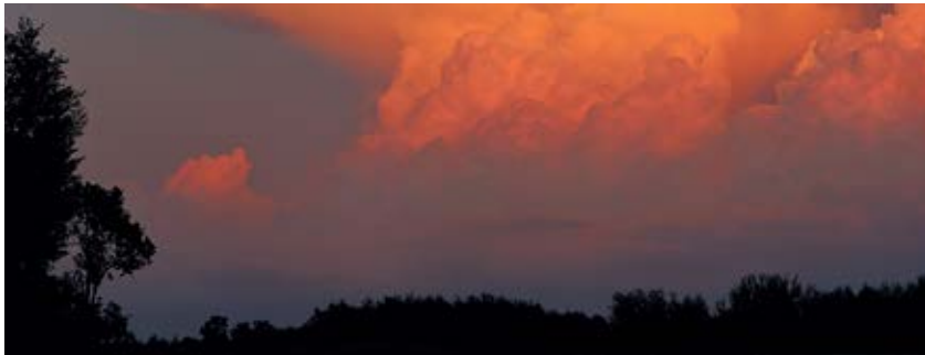
North winds help push migrating birds south, but stormy skies sometimes force the travelers to land.

Ducks, geese, loons, hawks, eagles, and other large birds migrate during the day. Hawks and eagles can take advantage of thermals —patches of upward-flowing air caused by the sun's warmth. On this warm air, they can rise and soar without flapping their wings.