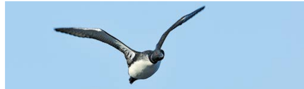
Researchers outfitted a few Minnesota loons with tiny geolocators to track fall and spring migration routes.