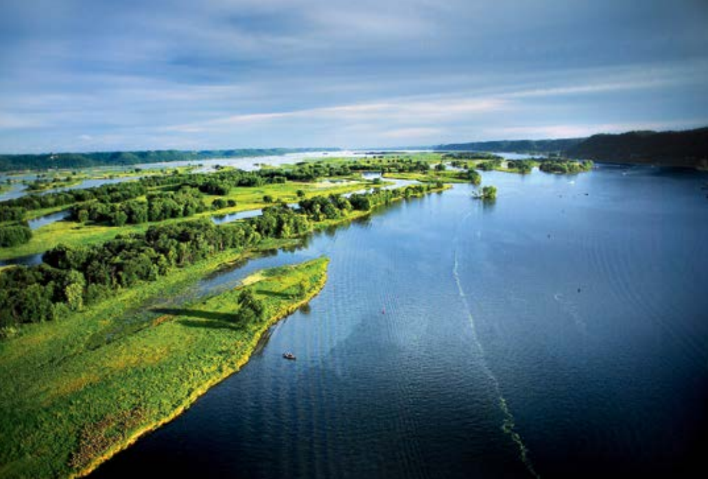
Migrating ducks and geese follow the Mississippi River south in fall and north in spring.