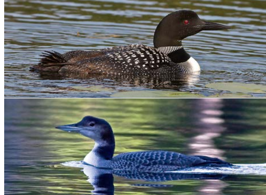
The loon's velvety black-and-white summer dress changes to steely gray in fall when it flies to its saltwater home.

Why do migratory birds come back to Minnesota in spring and stay for summer? In summer Minnesota has good habitat for birds to raise a family, and birds find less competition for places to build a nest. The long daylight hours give parent birds lots of time for finding food for hatchlings. With plenty of sun and rain, forests and fields grow ripe with berries and seeds for birds to eat. Insect-eating birds find lots of bugs. In summer, Minnesota is for the birds!