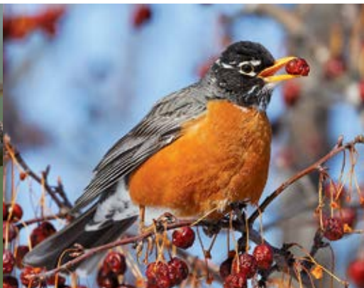
The mourning warbler flies to Central America for winter. The American robin stays around as long as it finds food.