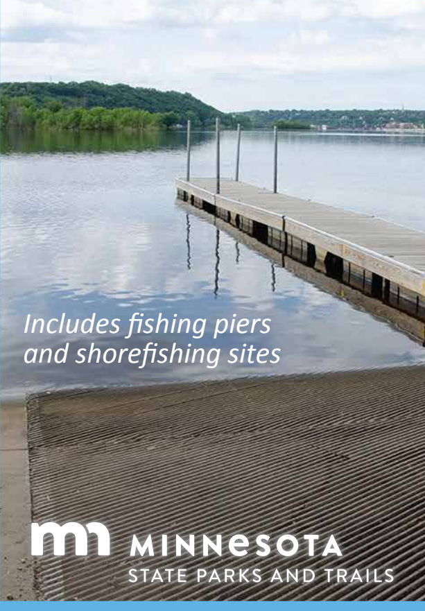
Includes fishing piers and shorefishing sites