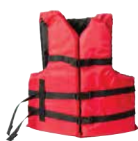
Both are life jackets. Both will save your life. But only if they're worn. #Wearit