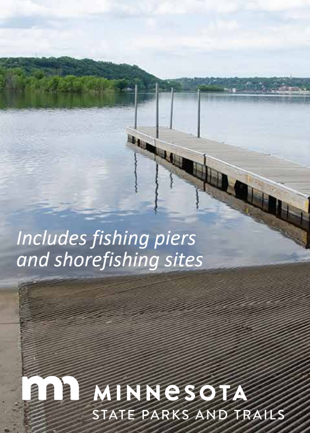
Includes fishing piers and shorefishing sites