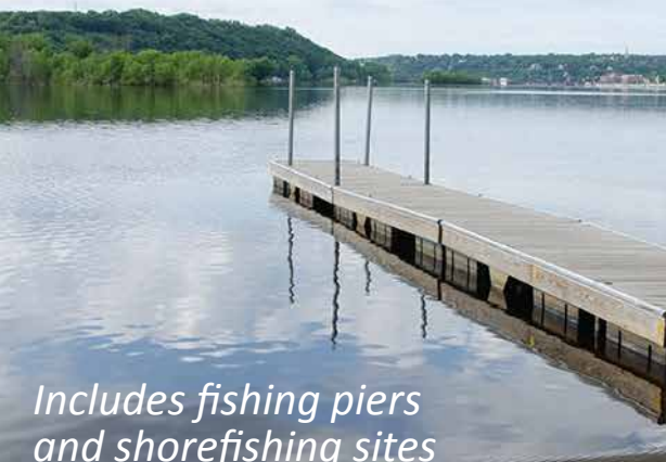
Includes fishing piers and shorefishing sites