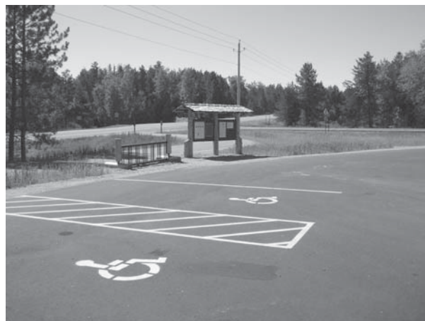
Parking lot on the Paul Bunyan at Highway 34 near Akeley.