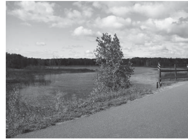
Along the Heartland Trail

Common mammals noticed along the trail include whitetail deer, raccoon, red fox, porcupine, beaver and muskrat. The observant trail user may spot coyote, weasel, mink, bobcat, black squirrel or black bear. Many varieties of birds can be seen along the trail including the bald eagle, which has a large population in the Chippewa National Forest and surrounding area.