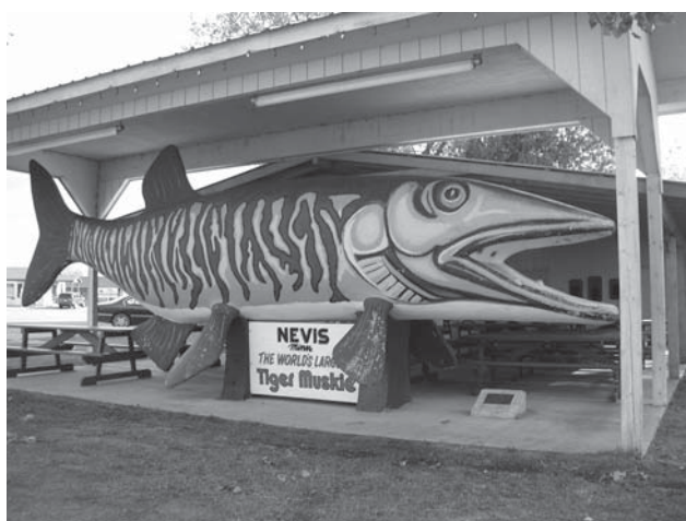
Tiger muskie statue on Heartland in city of Nevis

The Minnesota Department of Natural Resources is an equal opportunity employer.