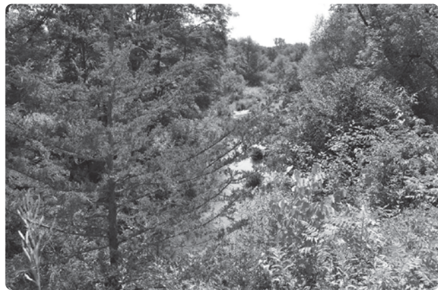
Overlooking Hay Creek on the north segment

Minnesota Department of Natural Resources Information Center 500 Lafayette Rd. St. Paul, MN 55155-4040 888-646-6367 | mndnr.gov/trails