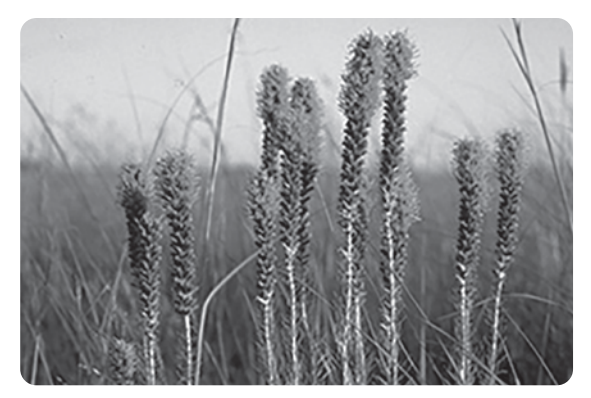
Blazing star flowers are prevelant along the trail

Enjoy views of rural landscapes along the trail. Travel past Myre-Big Island State Park for diverse natural environments like wetlands, oak savanna, big woods and prairie. Visit during spring or fall migration for excellent birding opportunities.