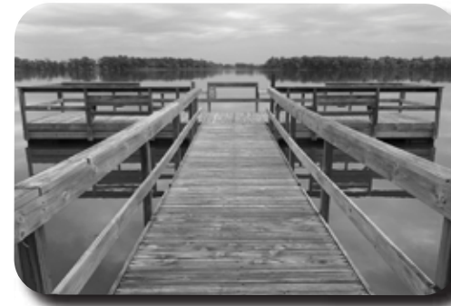
Cast a line from the fishing pier.

Visit to experience an area rich in wildlife where water, prairie, forest and agriculture all meet.