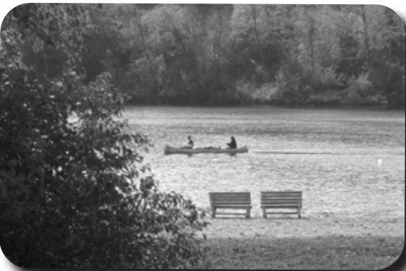
There are so many ways to discover William O'Brien State Park.