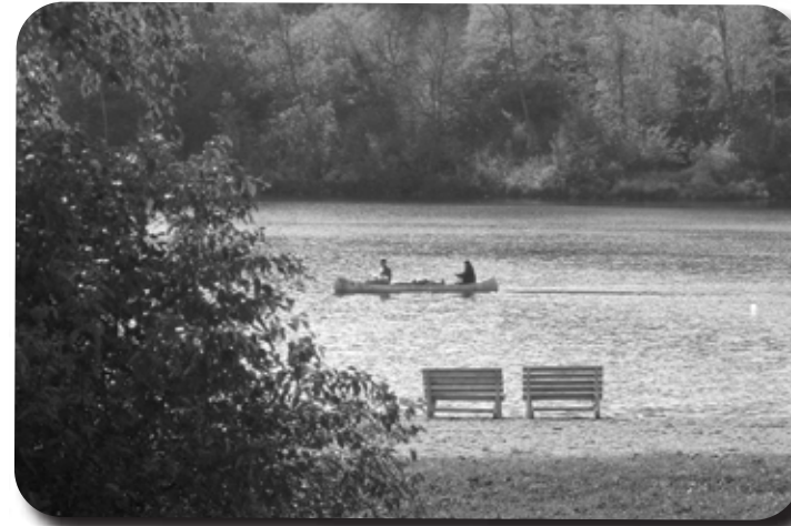
There are so many ways to discover William O'Brien State Park.