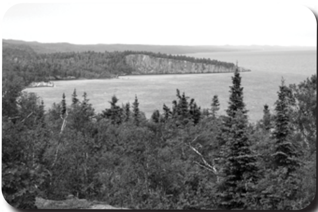
Experience stunning views of Lake Superior at the park.

In the heart of the park, on the shores of Mic Mac Lake, Tettegouche Camp was built over a hundred years ago. You can rent any of the four original, rustic log cabins for an overnight stay or use the lodge, built in 1911, for a unique picnicking site (hike-in only). Experience the quiet northwoods wonder that has captivated humans through the centuries.