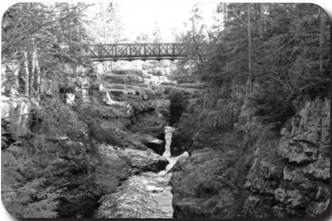
Watch water rush through the rocky landscape.

This 1.1 billion year-old landscape became a state park in 1957, but visitors have been attracted by its scenery for far longer. The rugged terrain is cleft by the Temperance River Gorge, a crack in the earth that the river rushes through on its way to Lake Superior. See and feel the power of the world’s largest freshwater lake at the beach and picnic area at the mouth of the river. Over 1,000 feet above the lake, Carlton Peak offers panoramic views of the surrounding wilderness. Visit the park for miles of trails, designated trout streams, or camping.