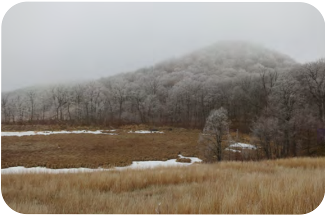
Enjoy views of snow-covered hilltops.

Changes in elevation, numerous lakes and ponds, and a mix of forest and prairie offer you a spectacular setting for skiing, snowshoeing, fishing, hiking, camping and more during your stay.