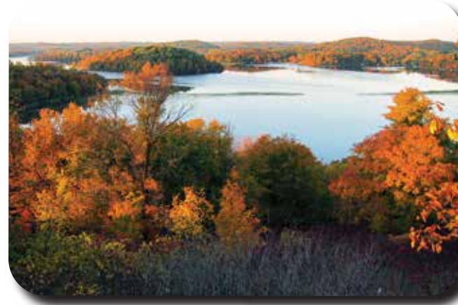
Find incredible views at Hallaway Hill.

Changes in elevation, numerous lakes and ponds, and a mix of forest and prairie offer you a spectacular setting for canoeing, fishing, hiking, horseback riding, camping and more during your stay.