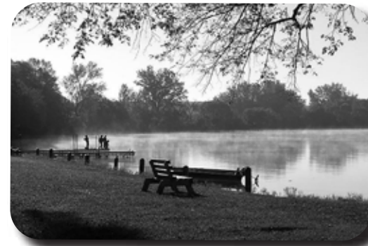
Delight in cool breezes along Lake Carlos.

Enjoy Lake Carlos by swimming at the beach, walking along the shore, watching for wildlife, or angling for an abundance of gamefish. Lake Carlos is the largest and deepest in the Alexandria chain of lakes at 2,520 acres and up to 163 feet deep. The water, trails and great campsites make this a popular destination.