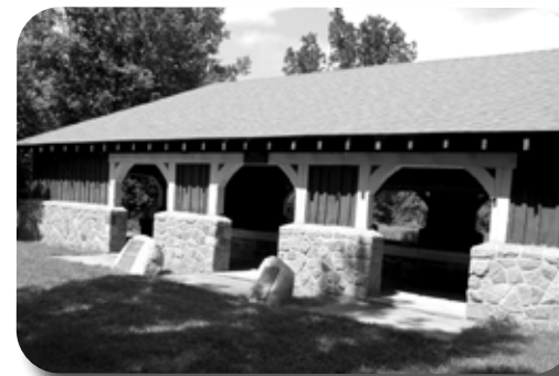
Experience the park's history.

The park was created in 1941 to offer recreation along Lac qui Parle Lake. It started as a Works Progress Administration (WPA) project for flood control along the Minnesota River. The WPA workers also built three, unique stone and timber buildings that you can still find on the west side of the lake. The lake's name is a French translation of the name the Dakota people gave it, "lake that speaks." If you visit in the spring, thousands of migratory waterfowl stop at the lake, adding a chorus of honking and quacking. Visit the park to experience the migration, paddle the lake, cast a line for fish, trek the trails or visit a historic site.