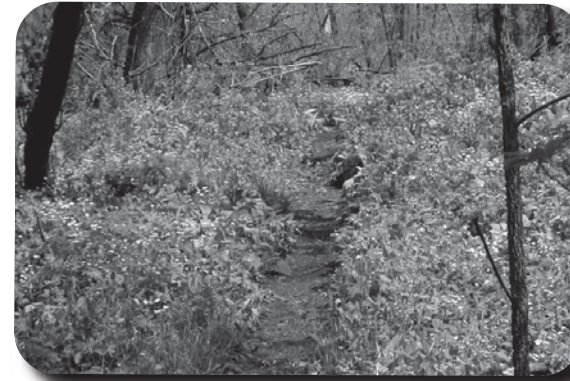
See Virginia bluebells each May during the park's Bluebell Festival.

Visit the park in spring for a parade of early wildflowers, or in the fall for a display of colorful oaks and maples. Come during any season to glimpse the towering white pines that first prompted the park's creation. State Senator James A. Carley and the Ernestina Bolt family donated this land in 1948 to preserve an outstanding grove of white pines found here. Look opposite the picnic area and you will still see some of these giants in the river valley today. In addition to the pines, spring wildflowers and numerous bird species, the park also protects a portion of the Blufflands Landscape Region. This is a unique area in southeastern Minnesota that features high bluffs, deep valleys and rolling uplands.