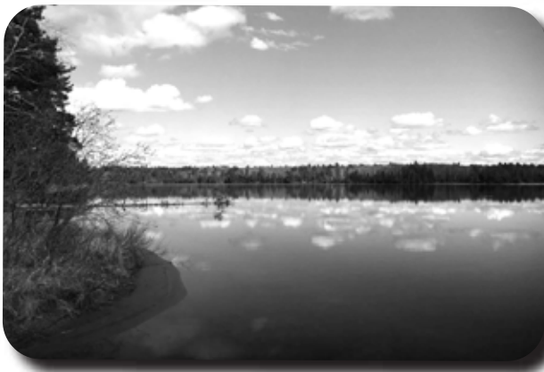
Scenic lake views await you at the park.

Experience an “Up North, Boundary Waters feel” as you hike, camp, fish and recreate in the park’s more than 4,000 acres. The lakes, hills and rocky landscape you’ll explore were shaped by glaciers. Walk beneath large pines that avoided heavy logging as early as 1895, a time when they were too small to be cut. Glimpse a variety of wildlife including black bears, grey wolves, white-tailed deer, pine marten, otters and moose. Visit in winter to ski, snowshoe, snowmobile or cozy up in one of the reservable cabins or guesthouse. The park was created in 1961 as a place for visitors to enjoy year-round. In 2010, it won the America’s Favorite Park contest.