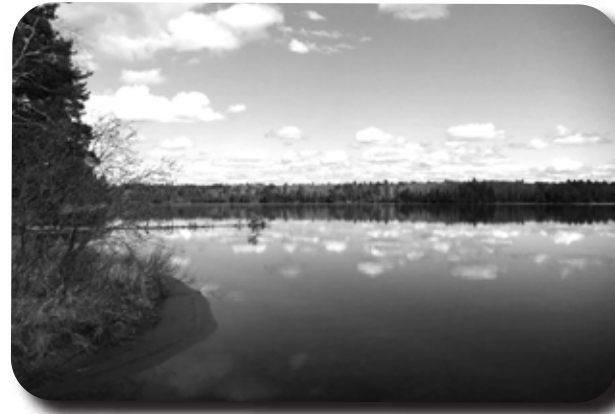
Scenic lake views await you at the park.

Experience an “Up North, Boundary Waters feel” as you hike, camp, fish and recreate in the park’s more than 4,000 acres. The lakes, hills and rocky landscape you’ll explore were shaped by glaciers. Walk beneath large pines that avoided heavy logging as early as 1895, a time when they were too small to be cut. Glimpse a variety of wildlife including black bears, grey wolves, white-tailed deer, pine marten, otters and moose. Visit in winter to ski, snowshoe, snowmobile or cozy up in one of the reservable cabins or guesthouse. The park was created in 1961 as a place for visitors to enjoy year-round. In 2010, it won the America’s Favorite Park contest.