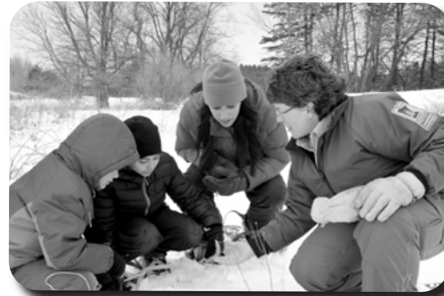
Explore from the top of the park's bluffs to the edge of the river.

Afton State Park was established in 1969 for visitors to experience unique natural features and enjoy outdoor recreation. Just forty minutes east of the Twin Cities, the park lies along bluffs overlooking the St. Croix River. Here you will see wildflowers and grasses in restored prairies that were once agricultural fields. Below, outcrops of limestone jut from the sides of deep, forested ravines that drop three hundred feet to the river. Make your way down to the water's edge and watch for wildlife. The park's diverse habitats make it a birdwatcher's haven with over 190 species, some of which are rare.