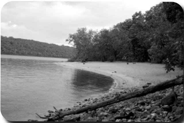
Explore from the top of the park's bluffs to the edge of the river.

Afton State Park was established in 1969 for visitors to experience unique natural features and enjoy outdoor recreation. Just forty minutes east of the Twin Cities, the park lies along bluffs overlooking the St. Croix River. Here you will see wildflowers and grasses in restored prairies that were once agricultural fields. Below, outcrops of limestone jut from the sides of deep, forested ravines that drop three hundred feet to the river. Make your way down to the water's edge and watch for wildlife. The park's diverse habitats make it a birdwatcher's haven with over 190 species, some of which are rare.