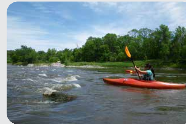
Pockets of rapids can be found along this stretch.

At the area around Redwood Falls, paddlers will encounter thick forest and high ridges that tower above the Minnesota River. Bordering the river is the recently created Whispering Ridge Aquatic Management Area, part of the effort of the Green Corridor Project to provide a trail system from Skalbekken County Park to Fort Ridgely State Park. You will also find a rock ledge that was once dynamited to allow steamboats upstream.