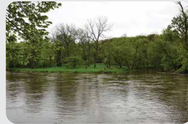
Spring rains raise river levels.

Hazards include dams; be aware of portage locations. Watch for snags (fallen trees) in the river that may tip an unwary paddler. The river also has several Class I rapids.