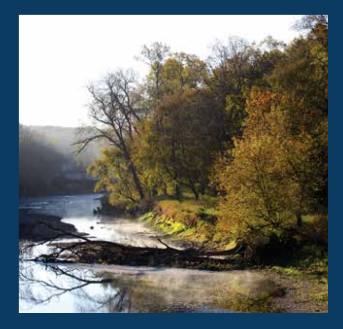
MINNESOTA STATE PARKS AND TRAILS