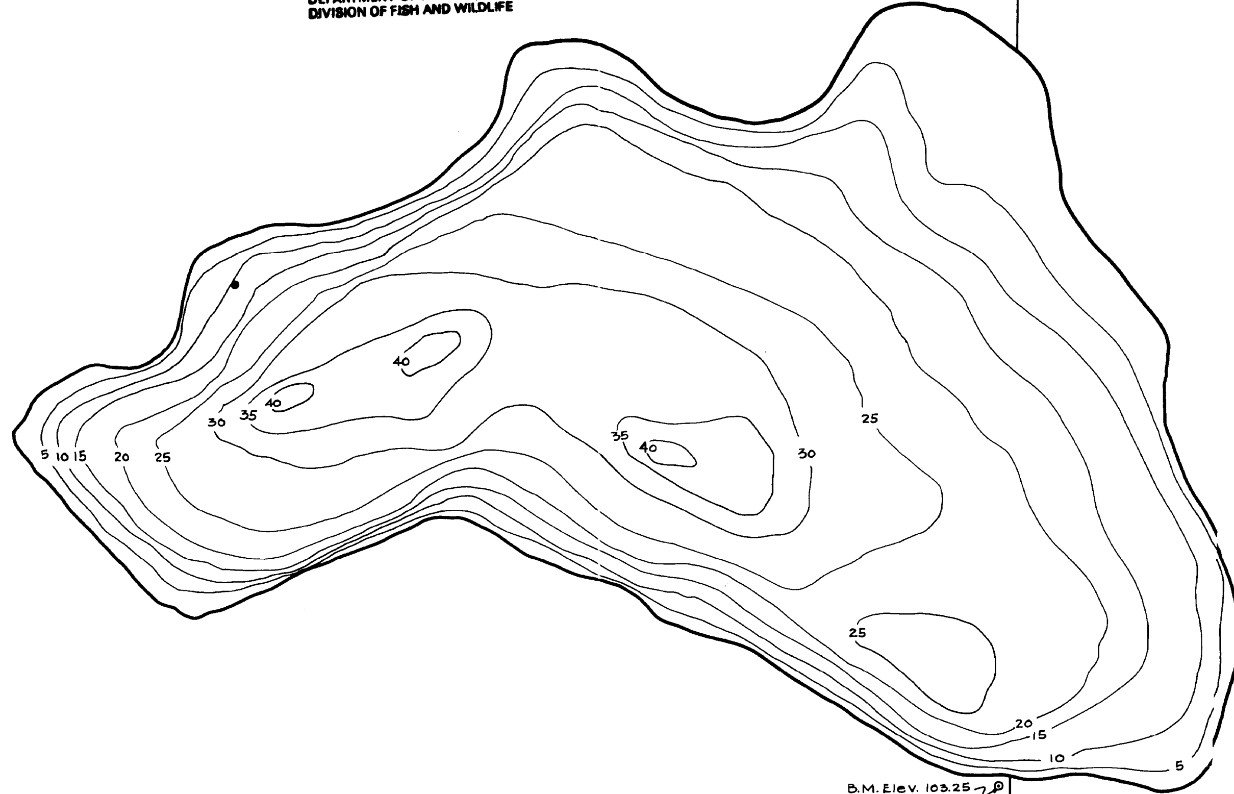
Contour Map Contour Intervals 5'

© COPYRIGHT 1983 STATE OF MINNESOTA DEPARTMENT OF NATURAL RESOURCES DIVISION OF FISH AND WILDLIFE