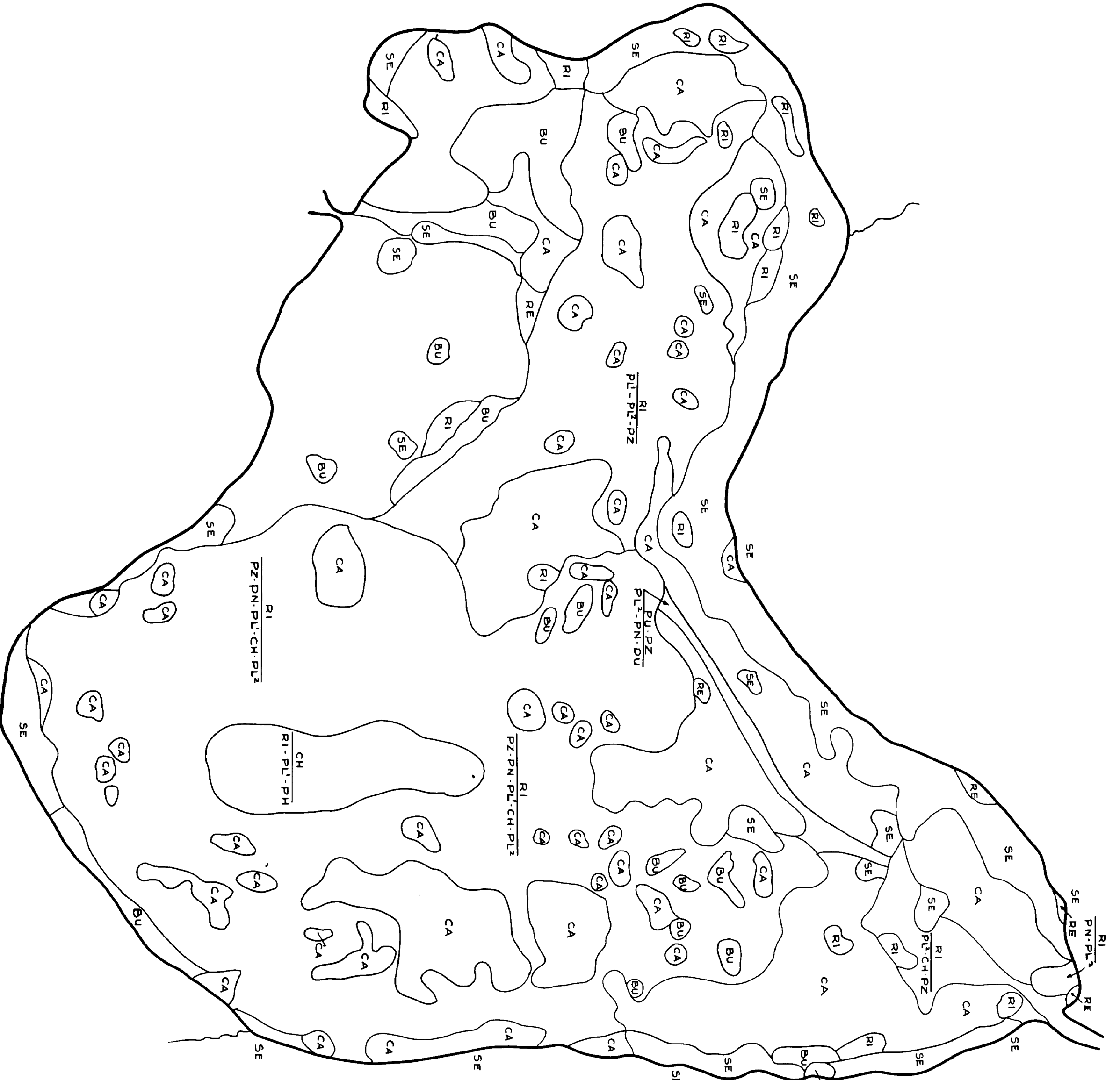
Cover Type And Lake Bottom Soil Type Map