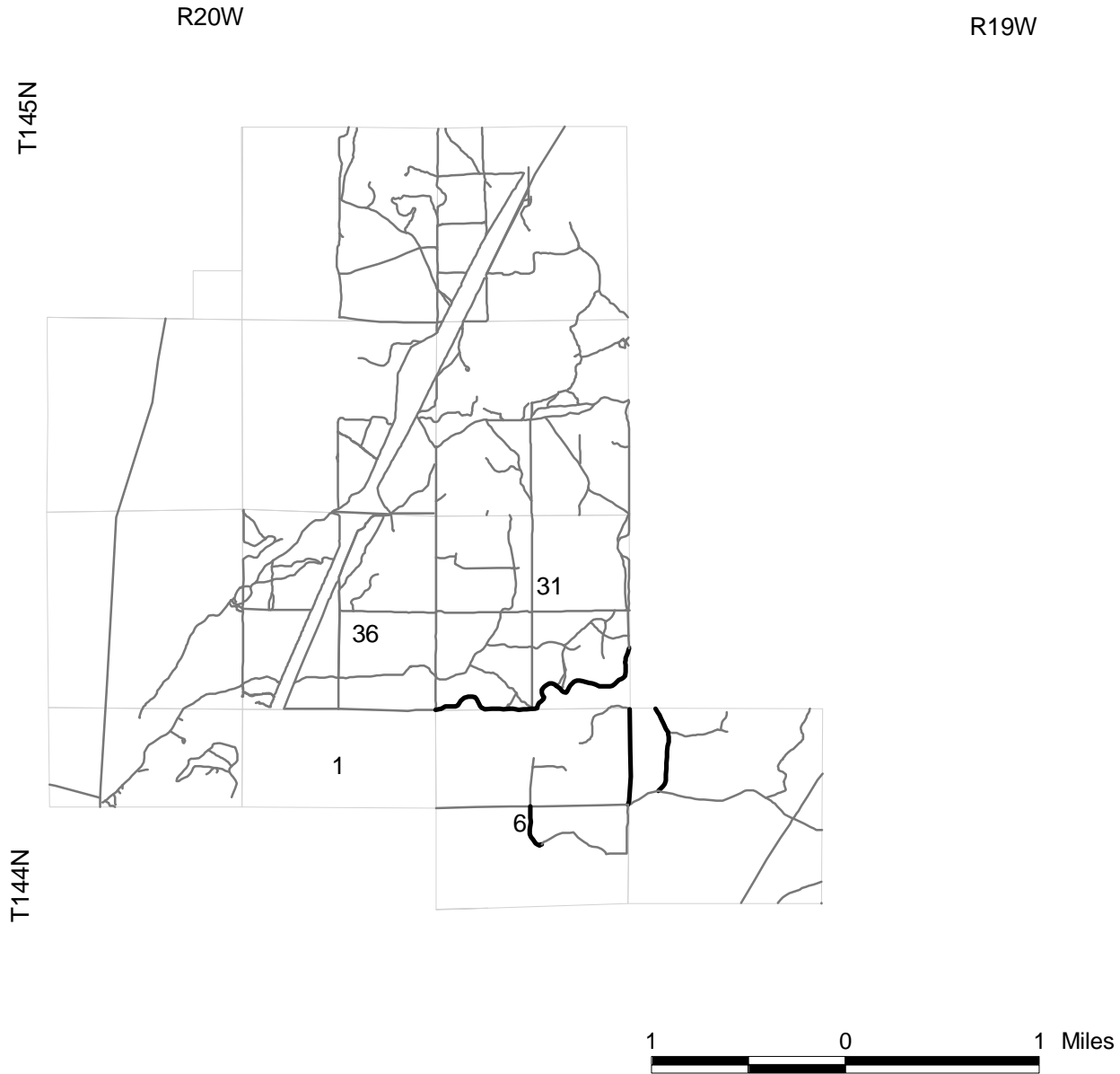
Exhibit A General C.C. Andrews State Forest Forest Road Designation February 2005