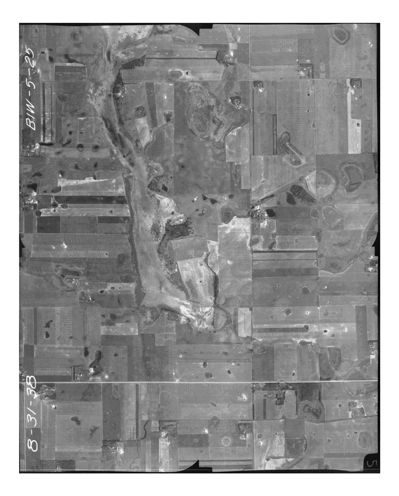
Figure 2. Lower portion of Upper Lightning Lake in 1938.