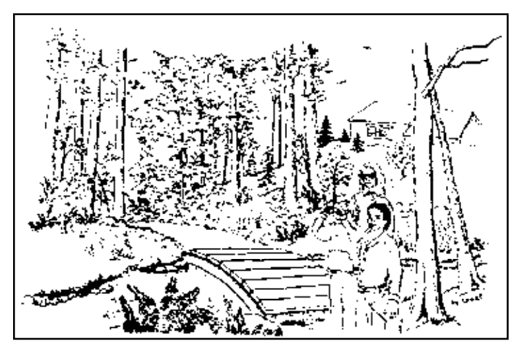
Figure 7. A community forest provides recreational and educational opportunities as well as environmental benefits and wildlife habitat.

Birds, mammals, fish, and other wild animals are a valuable resource. For many, their survival depends on the presence, structure, composition, and distribution of wooded areas across the landscape (Figure 7). Habitat requirements (shelter, food, water, diversity) vary among species. For example, squirrels may require only a few trees, while chipmunks require a small wood lot and other wildlife species may require much larger areas. Habitat requirements for a greater number of wildlife species can be met in urban wooded areas by conserving a network of connected green corridors and natural wooded open spaces across the landscape.