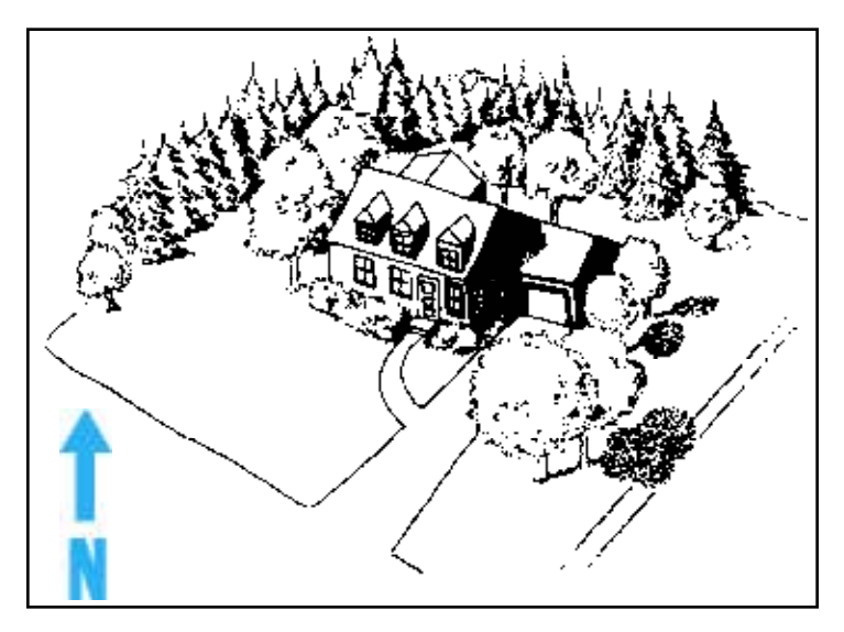
Figure 5. A windbreak on the west and north of the building and shade trees on the east and west of the building significantly reduce the cost of heating and cooling.

Trees are living infrastructures. Shade trees can reduce the cost of cooling by up to 25 percent during hot summer months. They also reduce the impact of urban heat islands caused by the concentration of pavement, buildings, air conditioners, and engines in urban areas. Tree windbreaks can reduce the cost of heating during cold and windy winter months by as much as 20 percent (Figure 5). Living snow fences can provide a low-cost solution to problems from drifting snow.