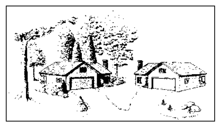
Figure 4. Properties surrounded with trees have higher market value than treeless properties because trees are part of the property infrastructure. In addition, trees provide a healthier and a more pleasant living environment.

conservation, and screening purposes) can increase the value of a developed property by 6 percent to 15 percent, or add 20 percent to 30 percent to the value of an undeveloped property (Source: Minnesota Society of Arboriculture, 1996).