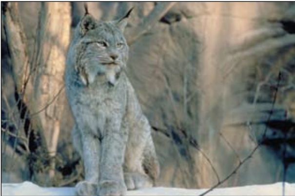
Carrol Henderson, Minnesota DNR

Some animals and plants are adapted to very narrow ranges of conditions in which they are able to live. These animals are called specialists . The Canada lynx, for instance, needs large tracts of relatively undeveloped forests for hunting. If roads or development fragment a forest, the reclusive lynx may not be able to roam through all of its territory, limiting its ability to access food, water, shelter, or a mate.