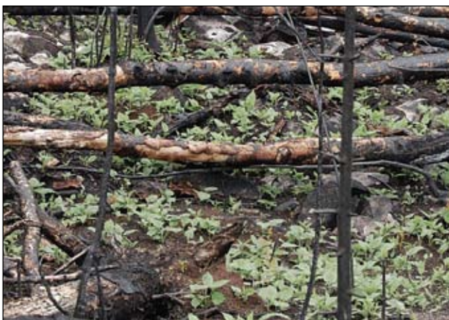
One month after fire.