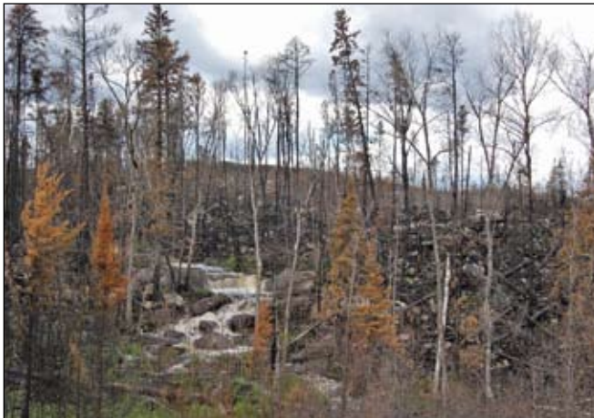
Ham Lake fire in northern Minnesota, 2007.

Within native plant communities, forests are named according to the conditions and dominant plants found in that community. There are more than 50 native plant communities in Minnesota. The following table lists some examples of native plant community names and places they can be viewed.