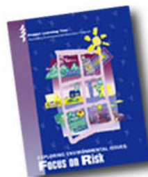
Exploring Environmental Issues: Focus on Risk