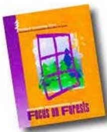
Exploring Environmental Issues: Focus on Forests