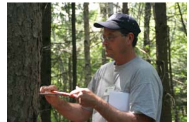
A teacher participant extracts a core sample from a tree during a recent TFF tour

The 2009 tour will be June 23 - 26, 2009 in Duluth. For several years, Minnesota PLT has helped send many PLT teachers to this exciting event, so watch for news on this soon!