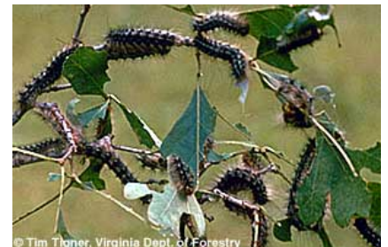
Oak being defoliated by gypsy moths

www.dnr.state.mn.us/treecare/forest_health/index.html